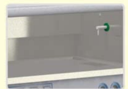
Stainless Steel #304